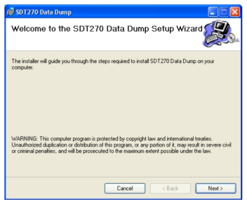
Click "Next". Then, the following screen appears:

You should now see the following screen: