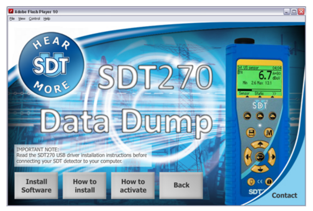
To continue the installation, please turn to the chapter "Starting up the installation".